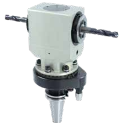
Twin Spindle Angle Heads