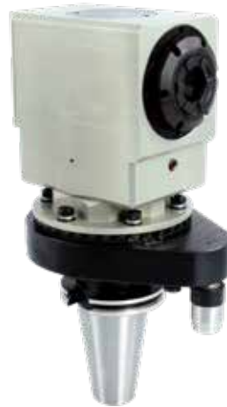
Standard Right Angle Heads