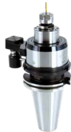
Nikken Spindle Speeder (up to 20,000 RPM)