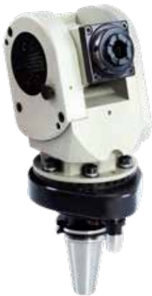
Universal Flexheads - Internal Coolant