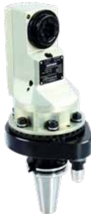
Slim Type Right Angle Heads