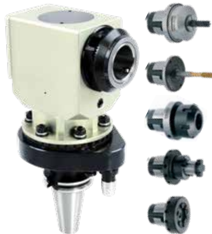
Quick Change Right Angle Heads (Attachments sold separately)