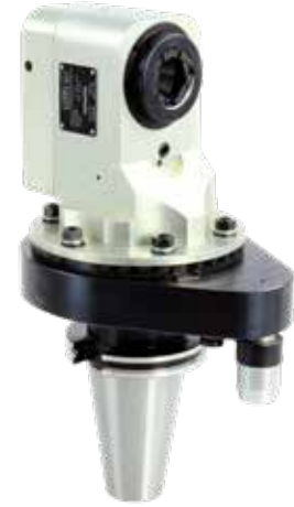
Offset Type Right Angle Heads