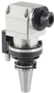
Economy 40 Taper Right Angle Heads