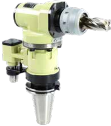
Nikken Right Angle Heads